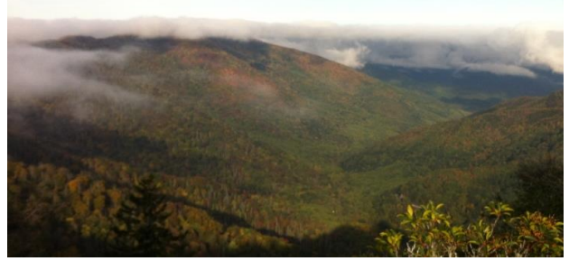
View of the Smoky Mountains from atop the Chimney Tops Trail in Great Smoky Mountains National Park